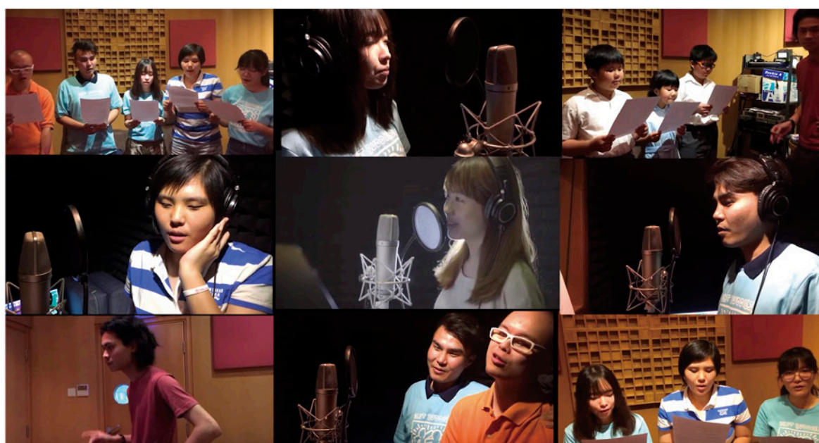
《星伴》MV製作花絮 The behind-the-scenes clips of the music video for ‘Friend of the Stars’